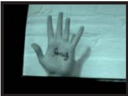
Video still from Orange by Savana.