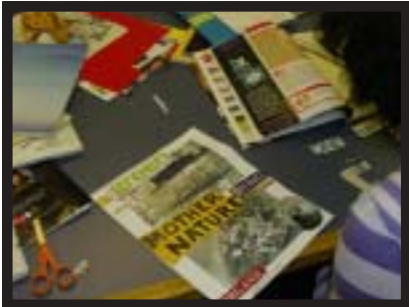
Materials on deck for the zine project.